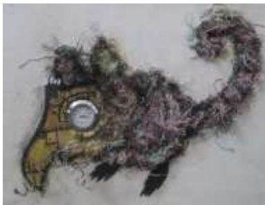
ASPIRE + BELIEVE + ACHIEVE